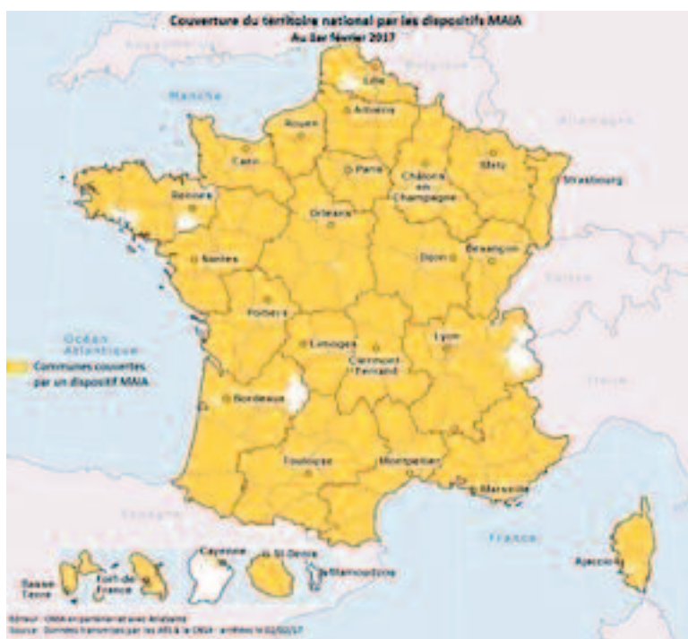
Figure 1. National coverage of the MAIA scheme on 1 February 2017