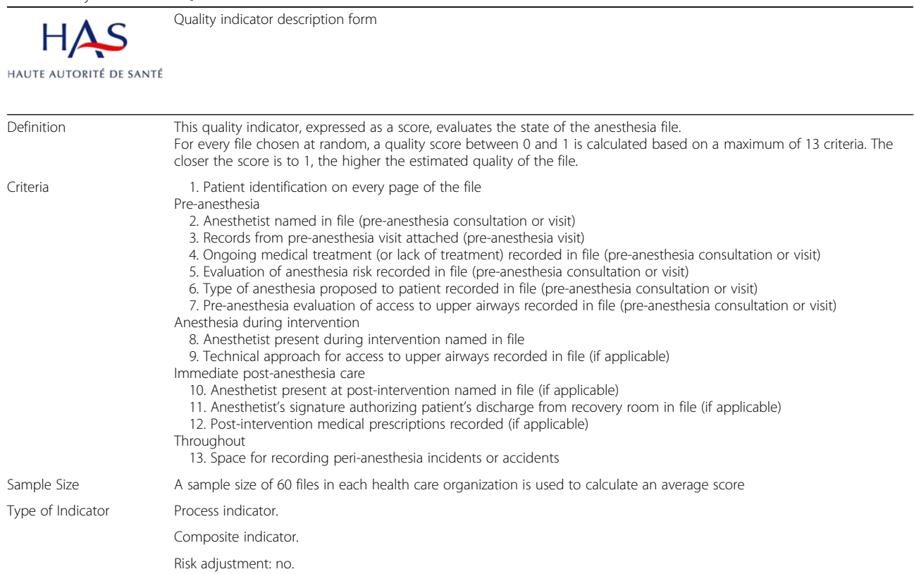
Table 1 Key elements of QAF

Very few anesthetists and nurses were aware of the QAF. In general, QAF scores were not perceived to hold any special relevance to how well an anesthesia unit functioned: “I flicked through the information on the indicator and went on to my next task” (Chief anesthetist, HCO A); “The anesthesia teams do not show